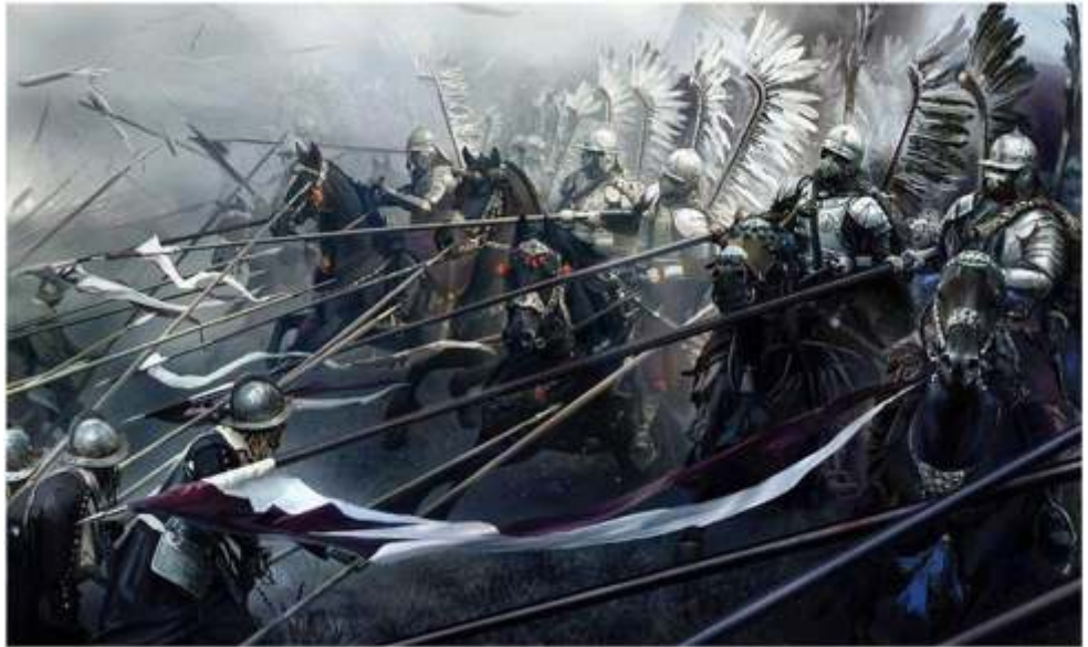
Polish winged hussars the most famous and beautiful cavalry.

The country's geographic location was shifted to the west and it largely lost its traditional multi-ethnic character. By the late 1980s Solidarity, a Polish reform movement, became crucial in bringing about a peaceful transition from a communist state to the capitalist economic system and liberal parliamentary democracy. This process resulted in the creation of the modern Polish state.