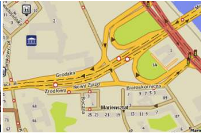
Royal Castle, pl. Zamkowy 4, Warsaw