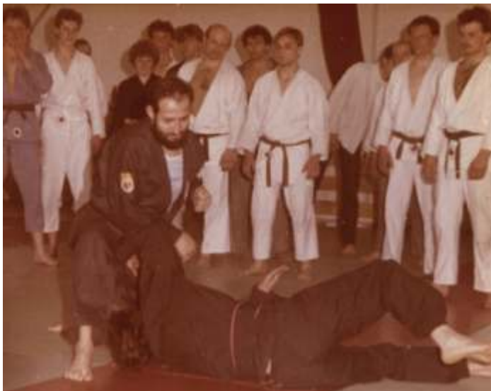
VVN VVD demonstration at an International Jiu Jitsu workshop in Warsaw in 1987.