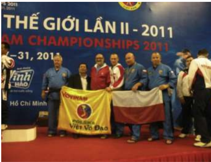
World Vovinam Championship in Vietnam in 2011