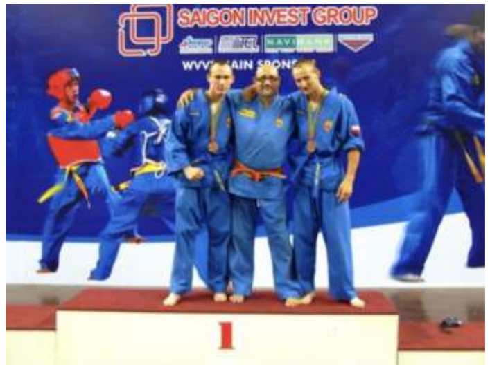
World Vovinam Championship in Vietnam in 2009