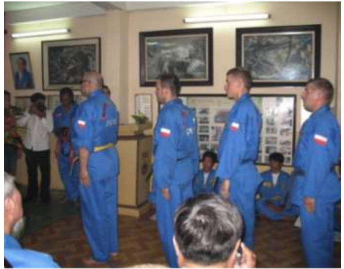
The Polish Team at To Duong in 2007