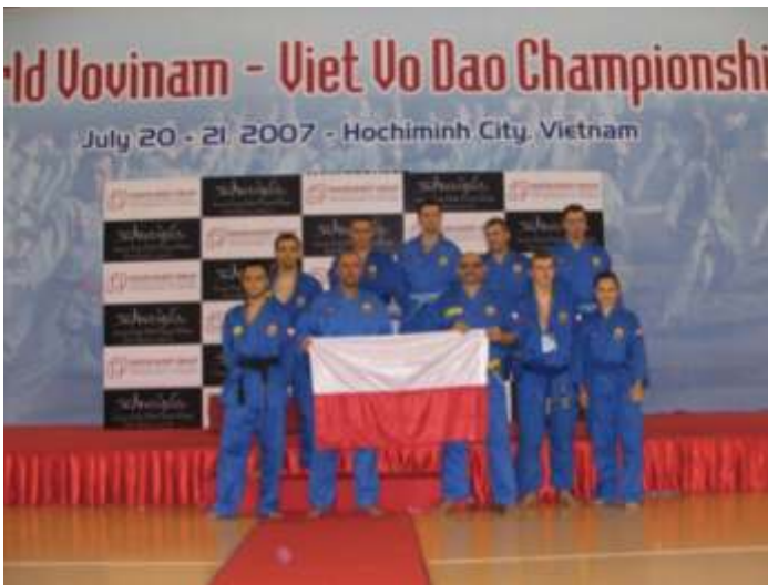
World Vovinam Viet Vo Dao Championship in Vietnam in 2007