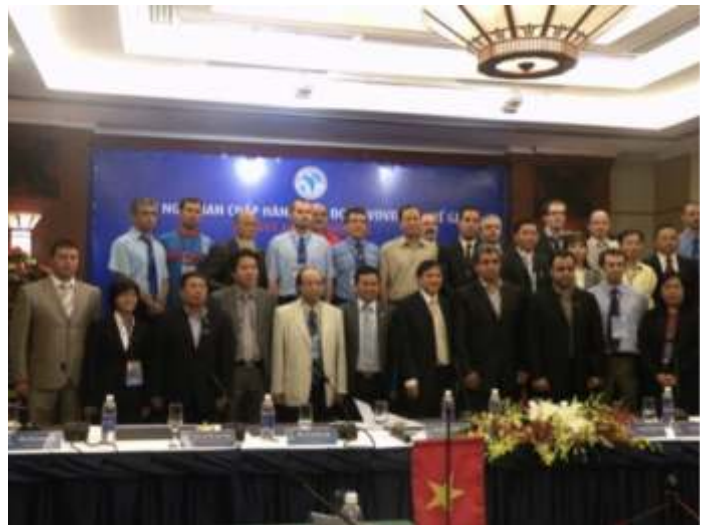
WVVF Annual Congress in Vietnam in 2011