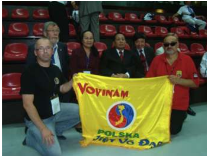
World Vovinam Championship in France in 2013