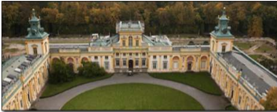
Palace of the King Jan III Sobieski in Wilanów Stanisława Kostki Potockiego 10/16 str. 02-958 Warsaw